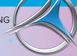
TABLE C: SCALING & MULTI-DOCTOR SYSTEMS

Whether you are hiring your first associate or opening your fourth location, scaling requires Operational Autonomy . This table focuses on the “CEO hand-off”: